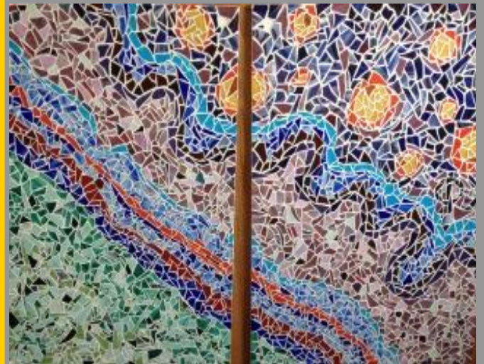
A mosaic mural produced by Phi Chi to be placed in the VG colonoscopy waiting room for patients and their families

https://docs.google.com/spreadsheets/viewform?pli=1&formkey=dGtseDQ4LWthNDk1T3pWeHVZbk9JMFE6MQ#gid=0